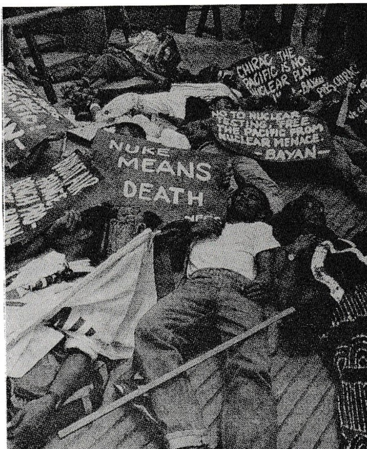
Die-in outside the French embassy in Manila organised by BAYAN and Nuclear-Free Philippines Coalition.

Most of IPB's material is in English. However to reach the more grass-roots audience, we need to ensure that our material is translated into at least the major languages. Many people have taken on this task and have distributed IPB statements, newsletter items, appeals and conference invitations around the movement in their own countries. We are most grateful to them all. The difficulty is that at present - except for the Women's Peace Platform project - we have no resources to pay for such translation work. We would appreciate any offers or suggestions on this matter. We have also given support to the Peace Translation Project , being established in London by Dr Agatha Haun. This aims to set up a clearing house linking peace/human rights organisations with translators. The project is based at War Resisters International, 5 Caledonian Rd, London N1 9DX, UK.