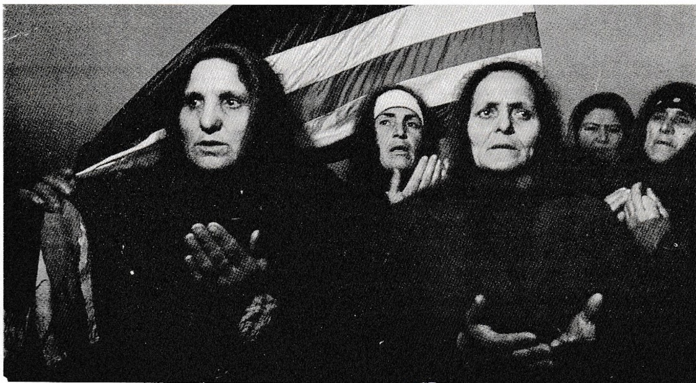
Women in Chechnya, 1995.

In 1995 the IPB decided to award the prize to the Committee of Russian Soldiers' Mothers , who have been campaigning for better conditions in the armed forces since 1990, but who achieved international recognition in the early days of the war against the Chechens, for their vigorous efforts to recover their sons from the battlefield. In the spring of 1995 they organised, together with a number of Russian and international peace groups, a Mothers' March for Life and Compassion to Grozny to protest against the war. The