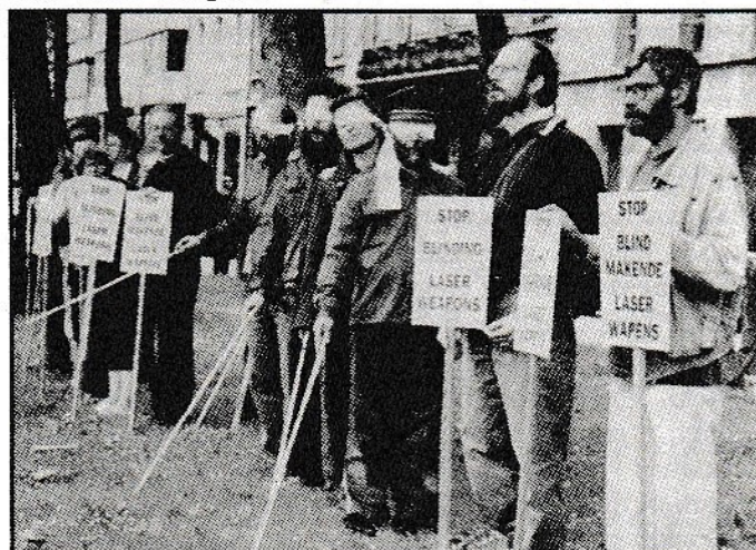
Demonstration against laser weapons, Netherlands, 23 June.

IPB is a member of the International Coalition to Ban Landmines. However, while several member organisations have been active in this field, we have not