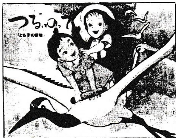
From the cartoon film 'On a Paper Crane'

On August 9 1995 Nagasaki, Japan and Faslane in the UK were linked in a unique way when Youth CND staged a die-in at the gates of the Trident base as CND Chair and IPB Vice President took part in the commemorations in Japan. The two events were separated in time and space but there is no doubt that they were linked with paper cranes and a deep determination to ensure that nuclear weapons are done away with now.