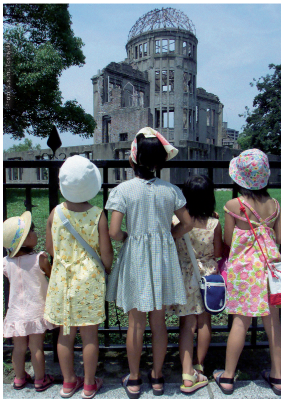
Japanese children look up at the Atomic Bomb Dome in Hiroshima Peace Memorial Park, Japan, 5 August 2000, on the eve of the 55th anniversary of the world's first atomic bombing.

This project has been one of the great successes of 2013. Making Peace is a major photo-exhibition , created by IPB and first shown in Geneva in 2010. It consists of 100 panels with images by major photographers, plus text in English and local languages. During 2013 the exhibition's curator Ashley Woods succeeded in negotiating venues for two important showings. The first was in Utrecht , where it was a highlight of the 2013 festival commemorating the 300th anniversary of the Peace Treaty of Utrecht 1713 . It was opened on the annual Liberation Day outside the cathedral, by the Dutch Prime Minister and other dignitaries. The exhibit was shown in the city centre from 11 April - 21 Sept.