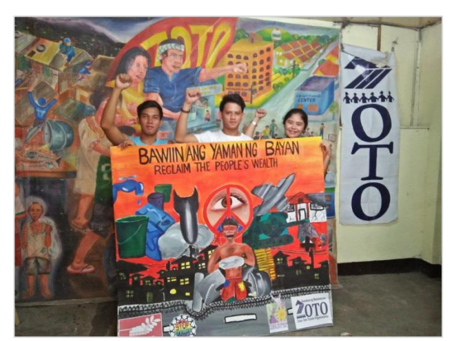
Mural action in Manila, Philippines: "To reclaim people's wealth"