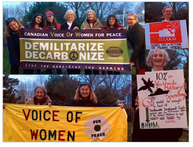
Halifax, Canada: Nova Scotia Chapter of Canadian Voice of Women for Peace produced a video to support GDAMs