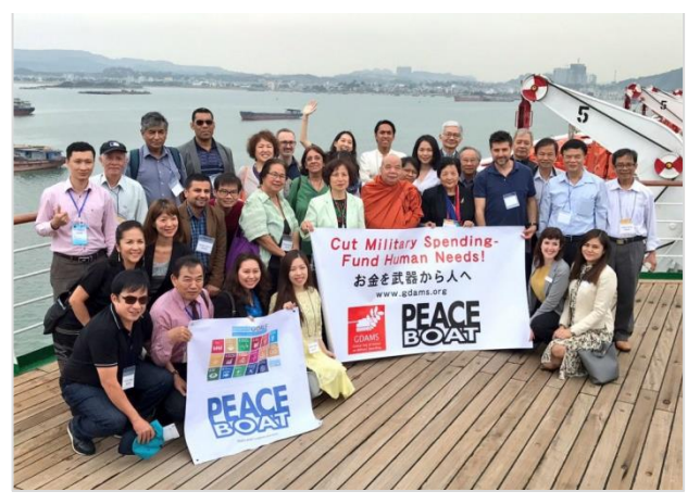
Peace Boat in Vietnam: Cut military spending and fund human needs