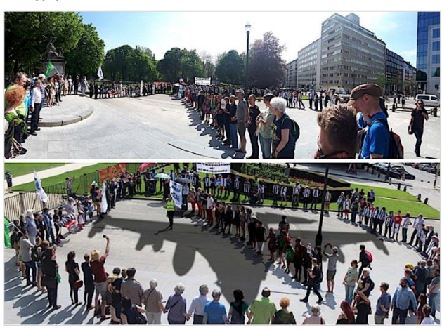
April 22, Rally in Bruessels against fighter aircraft. Symbolic Action "No to fighter planes!" Organised by Vrede VZW