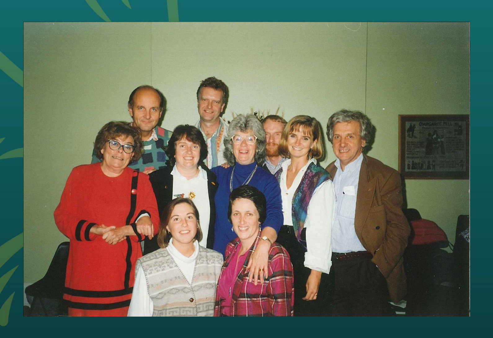
Again IPB Executive Committee. London, 1993.