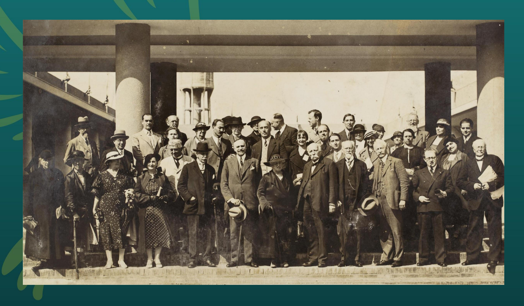
IPB General Assembly. September, 1935 [location unknown].