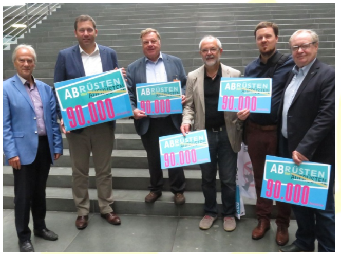
Meeting with the SPD Parliamentary Group

Members of the working committee of "Appeal: Disarm! Don't Arm!" ("Abrüsten statt Aufrüsten") symbolically presented the over 90.000 gathered signatures that were collected to oppose the planned raise in military expenses within the budget of the German Government for 2019.