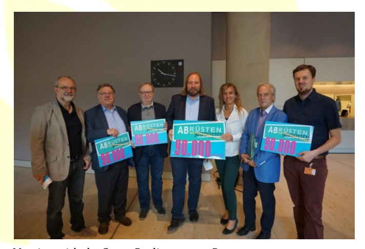
Meeting with the Green Parliamentary Party

Therefore, the collection of signatures will be continued!