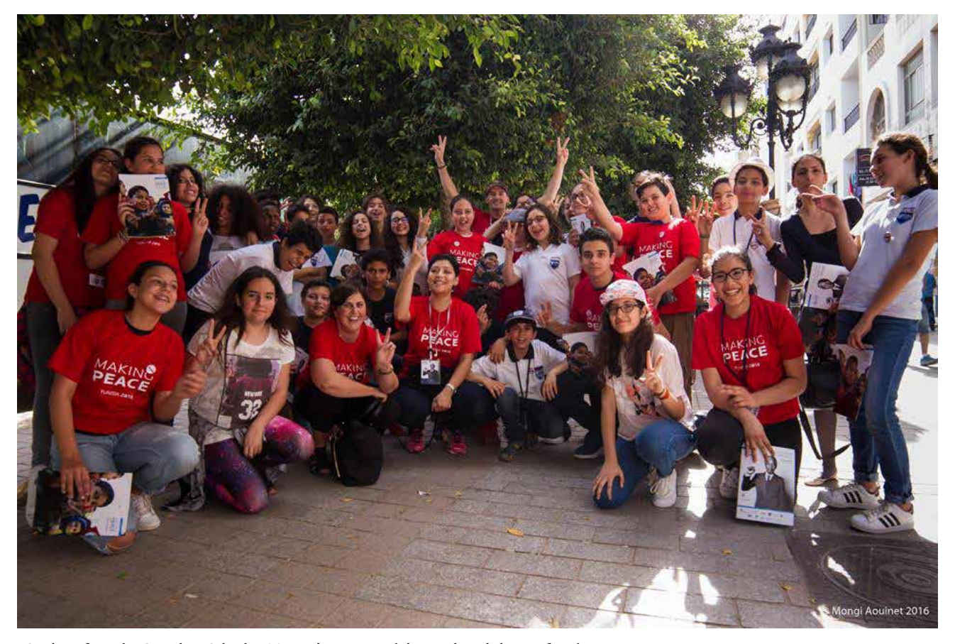
Students from the Canadian School in Tunis, during a workshop and guided tour of Making Peace.

cause of peace. It was created by IPB and first shown in Geneva in 2010, the centenary of the Nobel Peace Prize awarded to the IPB. It aims to teach the public, especially young people, the key elements necessary to create a 'sustainable peace'; providing a stimulus