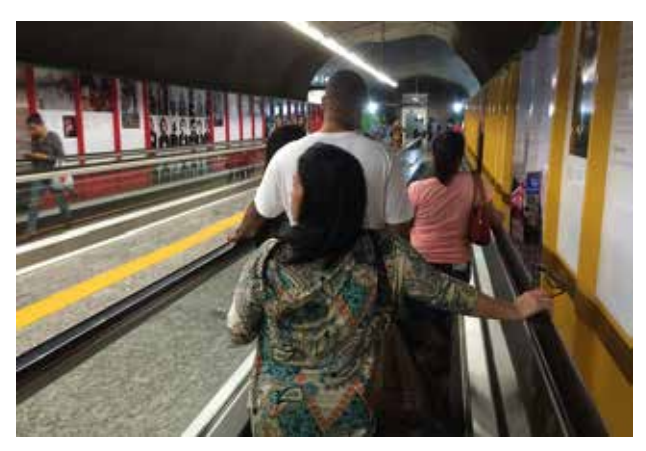
... and here it is in the metro in Rio de Janeiro.

for people of all ages to get involved in bringing about positive change. It consists of 100 panels with images by major photographers, plus text in English and local languages. It is curated and organised by Ashley Woods of REAL Exhibition Development. Related activities include a teachers' guide and interactive on-site workshops and presentations. In 2016 it was shown in 3 venues: in the cities of Tunis, Sfax (Tunisia), and Rio de Janeiro during the Olympic Games. Updates can be found on the Making Peace website and social media pages.