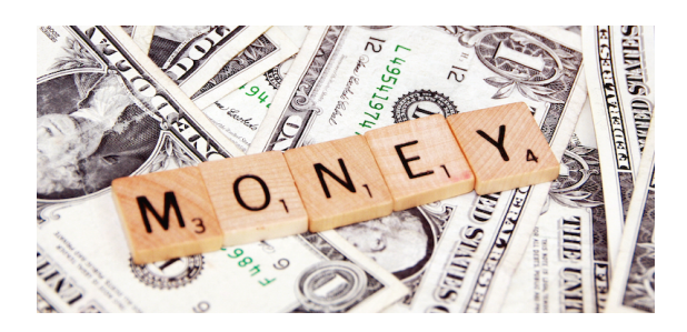
IPB is in need of support! Please consider:

together in 2014 are in Pakistan - India, Iran -Tunisia. These tours support the international campaign to ban nuclear weapons 2020.