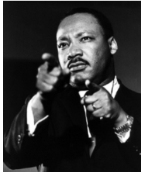
Martin Luther King Jr (1929 – 1968)

The city that will host the Making Peace exhibition is Atlanta, Georgia, where a number of important organizations are situated, notably The King Center where Making Peace is set to open on the 21st September 2015: UN International Day of Peace.