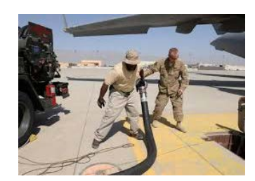
Report: Contractors outnumber U.S. troops in Afghanistan 3-to-1

Defense Department contractors in Afghanistan still outnumber U.S. troops by a 3-to-1 margin according to new research released this week, raising questions again about the role those workers play in the ongoing wars overseas and the oversight they receive. The data, compiled by the Congressional Research Service and first reported by Politico, shows contractor numbers in both Iraq and Afghanistan dating back to fiscal 2007. Combined, the Defense Department spent more than $220 billion on contractors in both war zones for a variety of services and support.