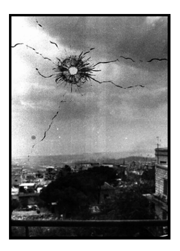
Movie: The Shadow World

SHADOW WORLD reveals the shocking realities of the global arms trade - the only business that counts its profits in billions and its losses in human lives. Directed by Johan Grimonprez and in part based on Corruption Watch UK founder Andrew Feinstein's globally acclaimed book The Shadow World: Inside the Global Arms Trade, the film reveals how the international trade in weapons - with the complicity of governments and agencies, intelligence investigative and prosecutorial bodies, weapons manufacturers, dealers and agents - fosters corruption, determines economic and foreign policies, undermines democracy and creates widespread suffering. The movie will be screening in London in September 17-24, Birmingham 16th and Glasgow 21st. For other dates in the world, click here.