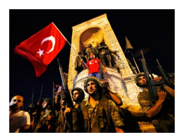
Turkey: Let's resist the spiral of violence and militarist imposition

Military coups have brought along human rights violations in every location they have taken place. In every place where the army has taken control by force, the violence has been further institutionalized societies who witness the coups have been stuck in spirals of violence. On one side military coup scenarios are being put into practice by "Peace at Home Council", on the other side AKP government's so "democratic moves" are on the agenda. This equation will enable AKP to further centralize the government by gathering the power in one hand and apply the totalitarian methods even more. Later in this process, the law enforcement forces can be controlled directly by the government; fascism and militarism will more institutionalized under the name of "democratization".