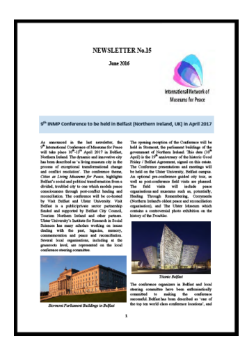
Museums for peace

excellent International Network of Museums for Peace Newsletter # 15 is now available at our website. Newsletter #15 is packed with great peace news from our INMP Associates. The next INMP newsletter (No.16) will be published in September. The deadline for fall submissions is 31st August 2016. (max. 500 words with one or two photos.) Please send your text and images news@museumsforpeace.org. For peace to flourish people need to know about the peace projects being presented around the world. Don't keep your peace work local; make it global through the INMP newsletter and website.