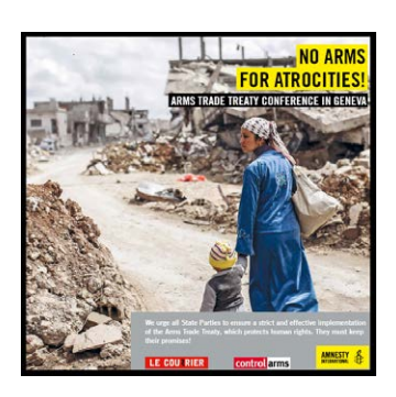
Amnesty International: No arms for atrocities – Arms Trade Treaty conference in Geneva

Amnesty International will organise between the 22nd – 24th August 2016 different activities to urge all State Parties to ensure a strict and effective implementation of the Arms Trade Treaty that protects human rights. A conference, street action, rally and a panel discussion will be organised. To see the details of the activities, please click here.