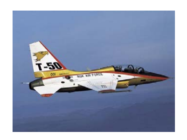
USA: Report: Western defense industry future imperiled by local programs