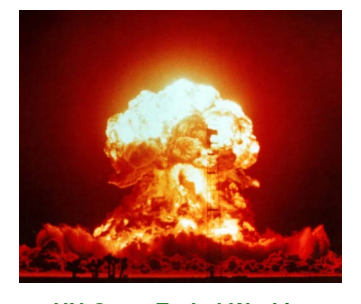
UN Open Ended Working Group closes session on upbeat note

The UN General Assembly voted in December 2015 to establish a special working group with a mandate to develop "legal measures, legal provisions norms" for achieving a nuclear-weapon-free world. The Open-Ended Working Group (OEWG) - backed by 138 nations - is focusing its efforts largely elaborating on the elements for a global treaty prohibiting weapons. The May 2-13 ended sessions indications that a group of non-nuclear countries is ready to start negotiations in 2017 on a treaty to outlaw nuclear weapons. Exciting news! Except that there are many other views...For contrasting perspectives on these crucial proceedings - which will not conclude until August - here are a few reports that crystallise some of the various positions: