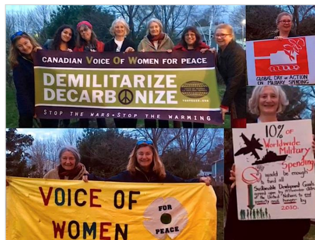
Halifax, Canada: Nova Scotia Chapter of Canadian Voice of Women for Peace produced a video to support GDAMS