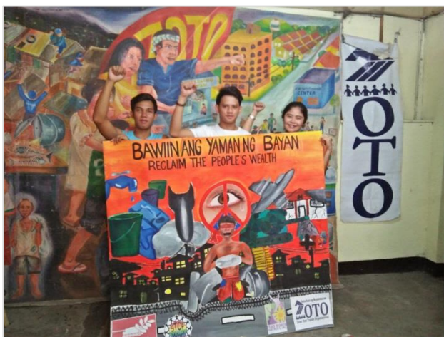
Mural action in Manila, Philippines: "To reclaim people's wealth"