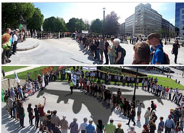
April 22, Rally in Brussels against fighter aircraft. Symbolic Action "No to fighter planes!" Organised by Vrede VZW