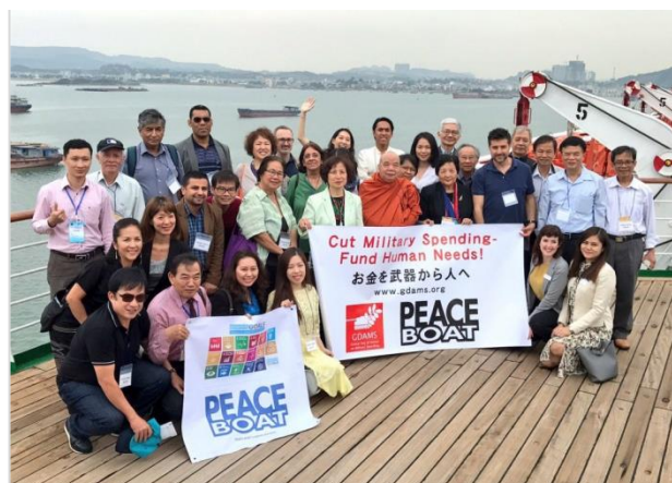
Peace Boat in Vietnam: Cut military spending and fund human needs