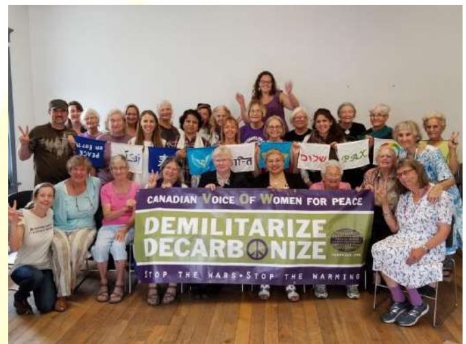
Canadian Voice of Women for Peace, Annual General Meeting in Toronto, Ontario, September 2018

products on the planet is the Pentagon. In Canada, the Department of National Defence is the biggest consumer of oil among all federal agencies. It is the same for the militaries of other countries in the NATO alliance, such as Poland. Carbon emissions from the US and NATO-led wars that are waged in Afghanistan, Iraq, Syria, Libya and Yemen are not counted.