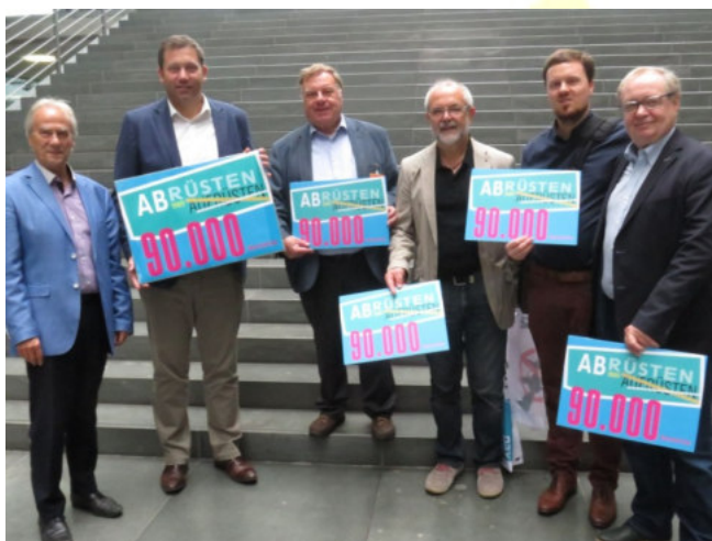
Meeting with the SPD Parliamentary Group

Members of the working committee of „Appeal: Disarm! Don’t Arm!“ (“Abrüsten statt Aufrüsten“) symbolically presented the over 90.000 gathered signatures that were collected to oppose the planned raise in military expenses within the budget of the German Government for 2019.