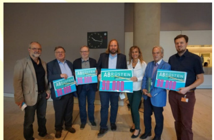
Meeting with the Green Parliamentary Party

Therefore, the collection of signatures will be continued!